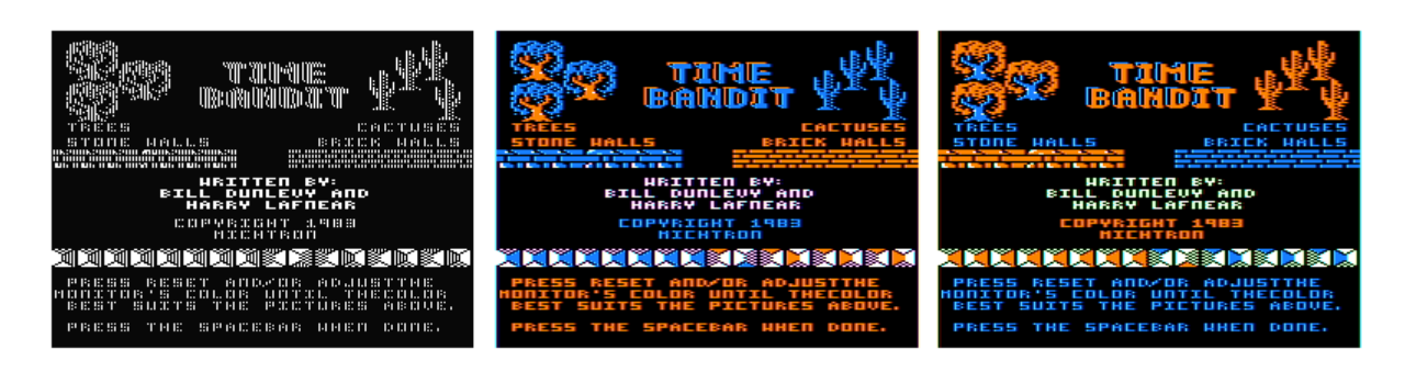
Figure 1.2: Time Bandit, Dunlevy & Lafnear, 1983 in different cross-colour modes

American software was often written to exploit cross-colour artefacts, where alternating patterns of black and white would "trick" the TV into displaying colour. XRoar supports this, and should enable it by default when you choose an NTSC machine. If you're running an NTSC game on a PAL machine, you can still force XRoar to render the colours by selecting a cross-colour option from View \rightarrow TV Input. There are also options that affect the fidelity of this rendering. See Section 8.2 [Video output], page 23, for more details.