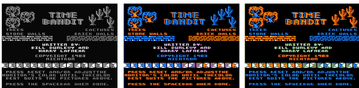
Figure 1.2: Time Bandit , Dunlevy & Lafnear, 1983 in different cross-colour modes

American software was often written to exploit cross-colour artefacts, where alternating patterns of black and white would “trick” the TV into displaying colour. XRoar supports this, and should enable it by default when you choose an NTSC machine. If you’re running an NTSC game on a PAL machine, you can still force XRoar to render the colours by selecting a cross-colour option from View → TV Input. There are also options that affect the fidelity of this rendering. See Section 8.2 [Video output], page 23, for more details.