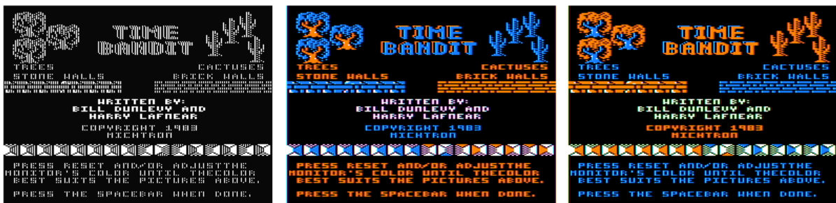
Figure 1.2: Time Bandit , Dunlevy & Lafnear, 1983 in different cross-colour modes

American software was often written to exploit cross-colour artefacts, where alternating patterns of black and white would “trick” the TV into displaying colour. XRoar supports this, and should enable it by default when you choose an NTSC machine. If you’re running an NTSC game on a PAL machine, you can still force XRoar to render the colours by selecting a cross-colour option from View → TV Input. There are also options that affect the fidelity of this rendering. See Section 8.2 [Video output], page 22, for more details.