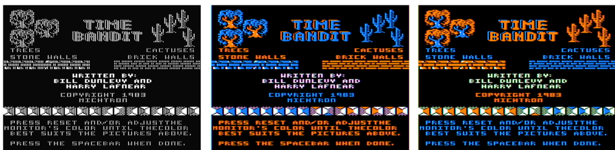
Figure 1.2: Time Bandit , Dunlevy & Lafnear, 1983 in different cross-colour modes

American software was often written to exploit cross-colour artefacts, where alternating patterns of black and white would “trick” the TV into displaying colour. XRoar supports this, and should enable it by default when you choose an NTSC machine. If you’re running an NTSC game on a PAL machine, you can still force XRoar to render the colours by selecting a cross-colour option from View → TV Input. There are also options that affect the fidelity of this rendering. See Section 8.2 [Video output], page 21, for more details.