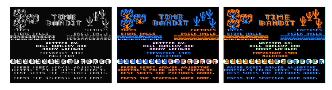
Figure 5.2: Time Bandit, Dunlevy & Lafnear, 1983 in different artefact modes

Try pressing Ctrl+A one or more times. What this really means is that you're used to running the program on an NTSC machine, and it makes use of cross-colour, but XRoar is emulating a PAL machine. Try starting with -default-machine tano or -default-machine cocous.