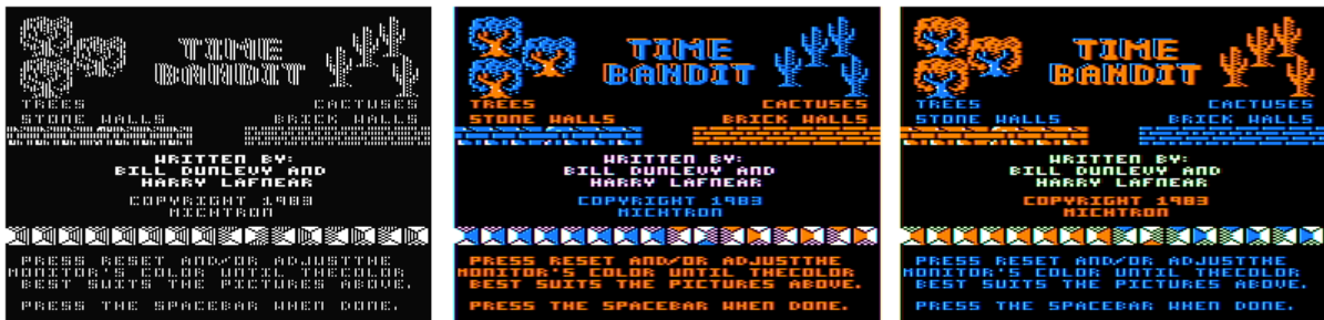
Figure 1.2: Time Bandit , Dunlevy & Lafnear, 1983 in different cross-colour modes

American software was often written to exploit cross-colour artefacts, where alternating patterns of black and white would “trick” the TV into displaying colour. XRoar supports this, and should enable it by default when you choose an NTSC machine. If you’re running an NTSC game on a PAL machine, you can still force XRoar to render the colours by selecting a cross-colour option from View → TV Input. There are also options that affect the fidelity of this rendering. See Section 8.2 [Video output], page 21, for more details.