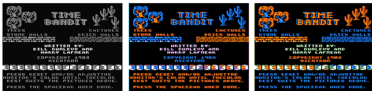
Figure 1.2: Time Bandit , Dunlevy & Lafnear, 1983 in different cross-colour modes

American software was often written to exploit cross-colour artefacts, where alternating patterns of black and white would "trick" the TV into displaying colour. XRoar supports this, and should enable it by default when you choose an NTSC machine. If you're running an NTSC game on a PAL machine, you can still force XRoar to render the colours by selecting a cross-colour option from View → TV Input. There are also options that affect the fidelity of this rendering. See Section 8.2 [Video output], page 21, for more details.