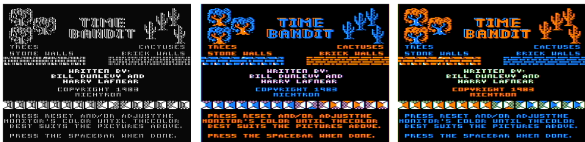
Figure 1.2: Time Bandit , Dunlevy & Lafnear, 1983 in different cross-colour modes

American software was often written to exploit cross-colour artefacts, where alternating patterns of black and white would "trick" the TV into displaying colour. XRoar supports this, and should enable it by default when you choose an NTSC machine. If you're running an NTSC game on a PAL machine, you can still force XRoar to render the colours by selecting a cross-colour option from View → TV Input. There are also options that affect the fidelity of this rendering. See Section 8.2 [Video output], page 21, for more details.